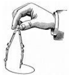
circul um delineat